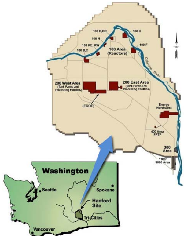
Figure 1. Hanford Site (EPA 2017).

The U.S. Department of Energy (DOE) manages approximately 2,500 metric tons of heavy metal (MTHM) 1 of spent nuclear fuel (SNF) that resulted mostly (85% by mass) from defense-related nuclear activities (primarily, weapons plutonium production reactors and naval propulsion reactors). Nearly all the SNF is stored at four locations: the Hanford Site in Washington State, the Idaho National Laboratory in Idaho, the Savannah River Site in South Carolina, and the Fort St. Vrain Independent Spent Fuel Storage Installation in Colorado (see the Board's fact sheet on DOE-Managed Spent Nuclear Fuel ). 2 Approximately 2,130 MTHM of SNF are in dry storage at the Hanford Site, a 586-square mile area in southeastern Washington State (Figure 1). Most of the SNF at Hanford was generated from the operation of nine defense-related plutonium production reactors located along the Columbia River (in the site area known as the 100 Area). The reactors began operating in 1944, when the B Reactor was commissioned, and ended in 1987, when the N Reactor was permanently shut down. Other SNF at Hanford was generated from the operation of the Fast Flux Test Facility 3 at Hanford and from commercial nuclear power reactors and research reactors.