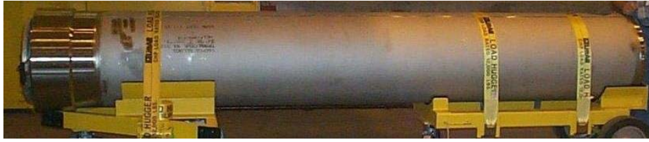
Figure 3. Multi-Canister Overpack (McCormack 2014a).

Hanford Site and will need to be placed into Nuclear Regulatory Commission-certified transportation casks for transportation offsite (Lorenz 1997).