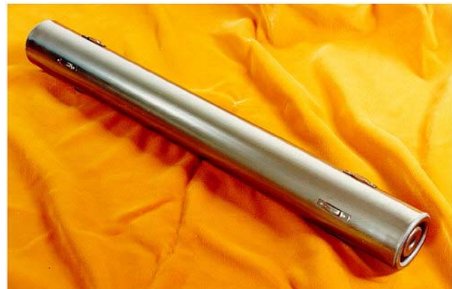
Figure 2. N Reactor Fuel (NRC 2003).

N Reactor SNF is uranium metal fuel with zirconium alloy cladding. As shown in Figure 2, N Reactor SNF elements include two concentric annular tubes with lengths that range from 15 to 26 in (38 to 66 cm) and an outside diameter of 2.5 in (6.4 cm). All N Reactor SNF has been vacuum-dried and sealed in packages called Multi-Canister Overpacks (MCOs) (Figure 3). MCOs are 25.3 in (64.3 cm) in diameter and 160 in (406 cm) in height, have a welded closure lid, and can accommodate 270 N Reactor SNF elements. MCOs are designed for storage, transportation, and disposal of SNF.